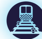
GPS-based Rail Geometry Maintenance