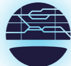
PTC active enabled in depots with poor GPS coverage