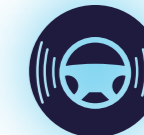
Enabling autonomous driving applications