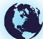
Seamless outside/inside transition

positioning, since spotted default like rail geometry can be precisely located with GPS coordinates, sharable with any GPS-enabled equipment.