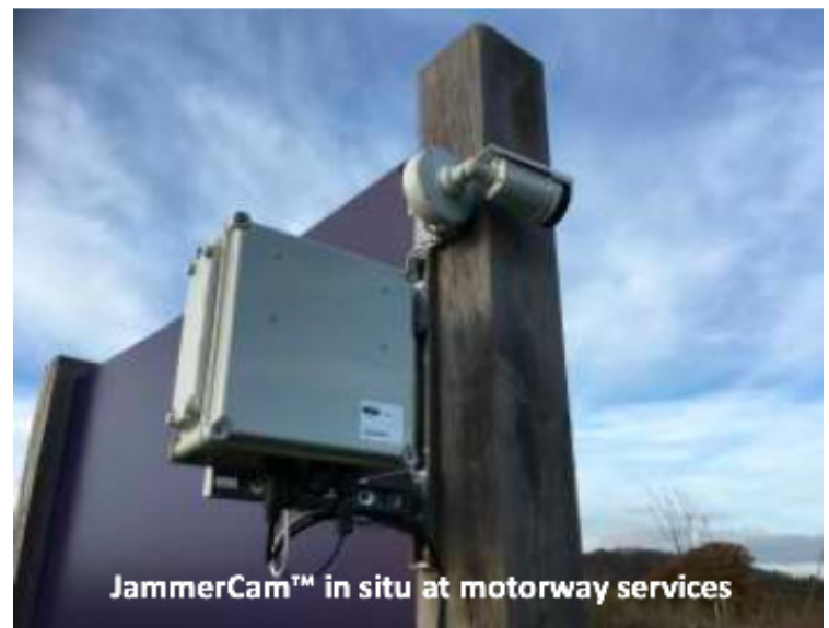
JammerCam™ in situ at motorway services

Chronos Technology - Proud to be Employee Owned