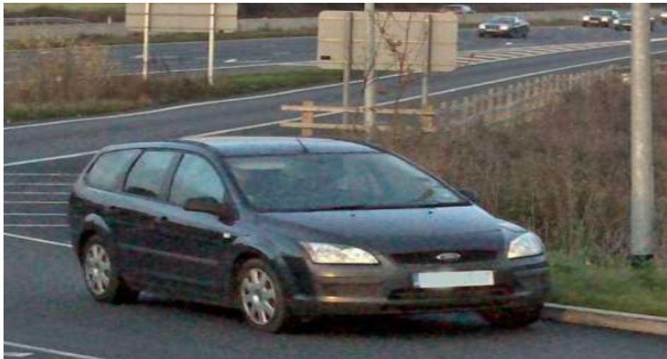
Example of image captured by JammerCam at trial site