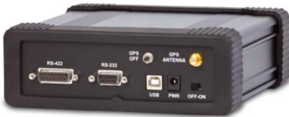
TimePort™ - Reverse Panel